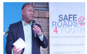
Minister of Transport Dan Plato made a speech at the SR4Y Belhar Launch

prevent drunk driving and walking, and to improve road safety. The project’s objectives are in support of the Decade of Action for Road Safety 2011 – 2020.