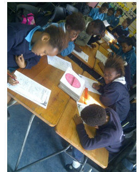
Dunoon learners doing Literacy Road Safety Activity

An impact study of the reflective backpacks will be done by Stellenbosch University thereafter.