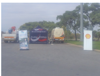
Haulier Wellness Clinics Stand

In December 2011, Haulier Wellness Clinics were run on four high volume stretches of our National highways.