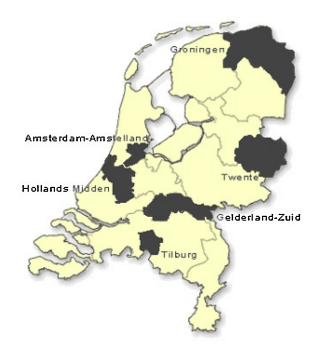
Fig. 1. Geographical distribution of the six police regions: Groningen, Twente, Amsterdam-Amstelland, Hollands Midden, Gelderland-Zuid, and Tilburg.

A roadside survey was conducted to determine the prevalence of alcohol among the general driving population in the Netherlands. A stratified multistage sampling design was used. In the first stage, four study regions were defined in the Netherlands: North, East, South, and West. These regions were considered to be representative for the entire country with regard to alcohol use and traffic based on the results of annually conducted national prevalence studies on alcohol use in weekend nights (DVS, 2008). Within these