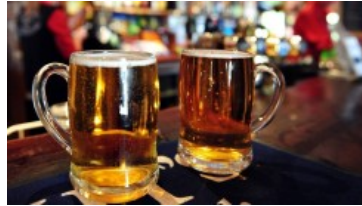
Want to open your dream bar? 9 things to consider