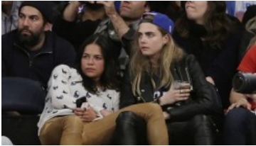
15 Gay Celebrities You Didn't Know Were Gay