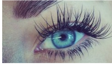
1 Weird Trick For Longer Lashes