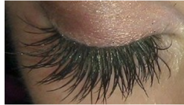
The Proven Solution For Long Sexy Lashes