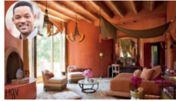
20 Gorgeous Celebrity Bedrooms