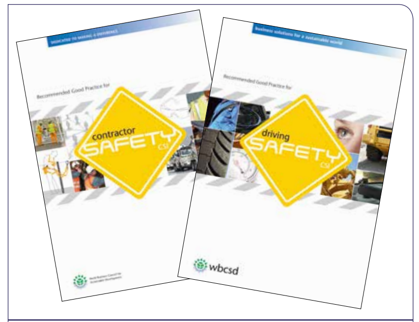
Figure 2. CSI publications offering guidance on safety for drivers and contractors.

The CSI provides an ideal platform for a shared understanding of sustainability issues, with safety being one topic of utmost importance. Members can share openly within a trusted, antitrustcompliant structure, not only about good practices, but also about near-missed cases and even failures, where sometimes the more crucial lesson lies. Knowledge sharing is not limited to experts in the task forces, CEOs of CSI member companies are leading by example by having a discussion entitled 'CEO Safety Moment', dedicated to safety management issues, at each of their annual meetings. This is clear and repeated testimony of safety by leadership and companies' determination to drive change from within the top levels of management.