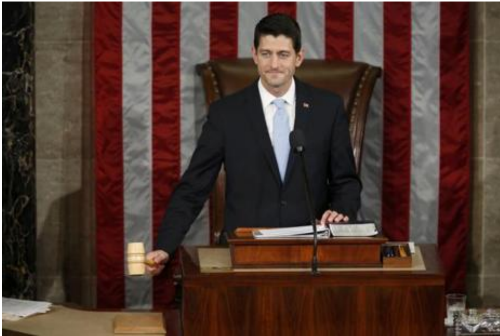
Paul Ryan elected US House speaker as Republicans try to halt chaos