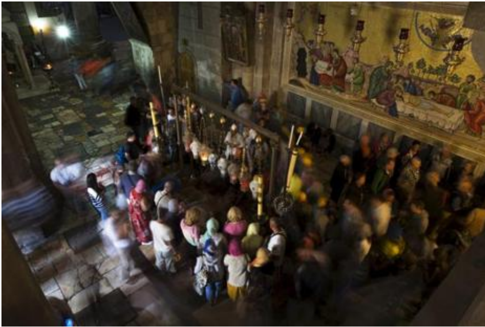
Amid wave of attacks, fear and loathing grip Jerusalem's Old City