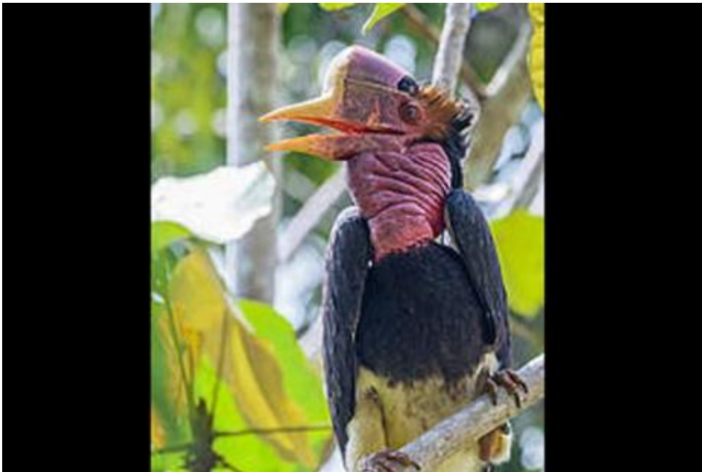
Eight more birds from India added to international list of threatened species