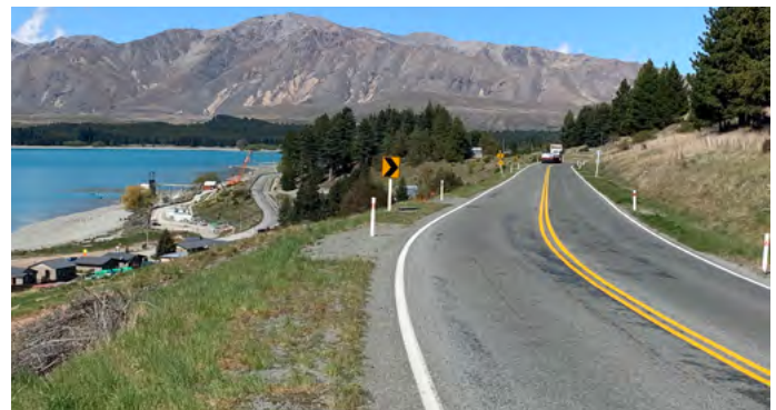
The site before the installation of the barriers

It became very apparent that a new risk had come from the tree removal, in that any vehicle that was to leave the road to the left was at risk of rolling all the way down to the campground below. We were able to make an immediate recommendation to Waka Kotahi that safety barriers were recommended for the site to prevent such events. These barriers were normally only recommended on sites that already had a crash profile due to statistical data. But as this posed a new risk due to an environmental change, this site was not deemed a priority. We persisted with the case that the area was at high risk, and as a result, the barriers were installed within 12 months.