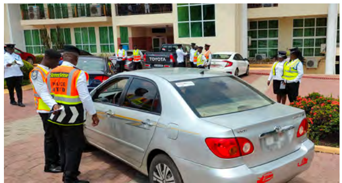
June's practical enforcement training in Kumasi, Ghana

The training proved to be a valuable opportunity to put into practice the SOP (Standard Operating Procedure), for speed enforcement which resulted in well-conducted and safe operations. Throughout the course of the practical sessions, 28 drivers were stopped for failing to comply with traffic regulations.