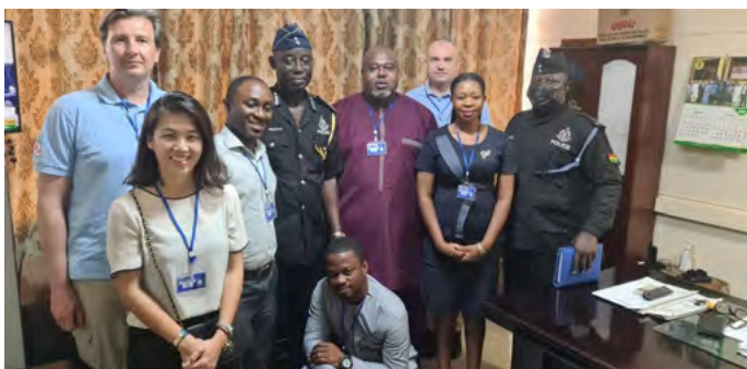
With the Director General of the Motor Traffic Transport Department (MTTD) Commissioner of Police Nyarko Aboagye in Accra, Ghana

In July, MTTD officers in Accra and Kumasi attended training sessions on the proper use of speed measuring devices, together with an official handover of brand-new equipment supplied by BIGRS. The practical workshops allowed them to test the devices under real road conditions, both during the day and night. The operations in both cities allowed a total of 74 officers to explore and learn about the devices' different features, including the Nighttime Infrared Illuminator and the automatic measuring mode.