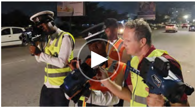
Watch the video here!

To close off the activities in Ghana for the month, a training session focused on the four main road safety risk factors of drink driving, speed and use of motorcycle helmets and seatbelts. The importance of basing enforcement actions on deterrence theory principles were also explained to the 43 Kumasi Metro guards and four municipal clerks who attended. The engagement of the attendees was clear throughout the period that training was delivered.