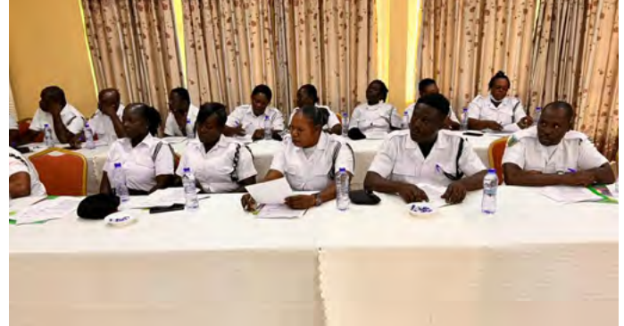
Road Safety Problems training for KMG officers in Kumasi, Ghana