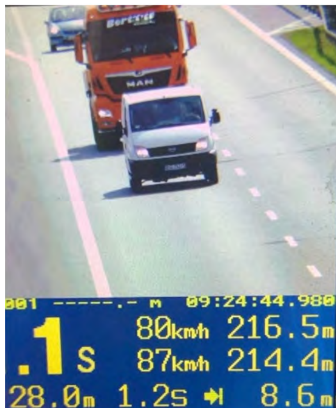
@BorowiakPolicja on Twitter

There are a variety of legal regulations or recommendations in terms of safe following distances, which vary from country to country, and travel speed. In some countries, the distance is calculated by the "2-second rule", such as in Denmark or the Netherlands. Simply, this means that the distance a vehicle should keep from another should equate to the distance traveled by the motorist in two seconds. Another regulation considers the half-speed rule. This rule states that the distance in meters should be half of the actual speed in km/h, which is the case in Poland.