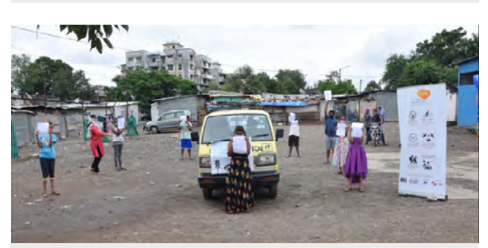
Blind Spot Activity Demonstration