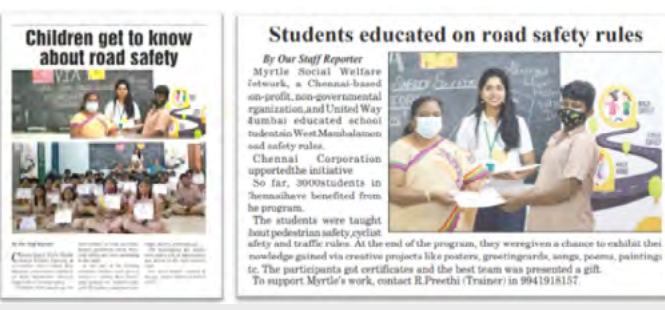
Newspaper Articles on VIA Implementation in Chennai