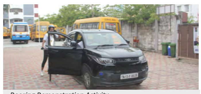
Dooring Demonstration Activity