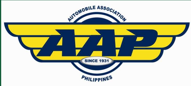
Automobile Association Philippines