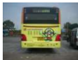
Bus ad. in Liuzhou