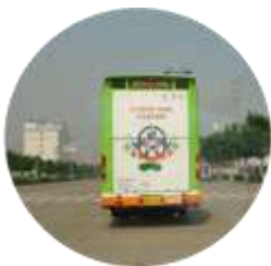
Bus ad. in Nanning