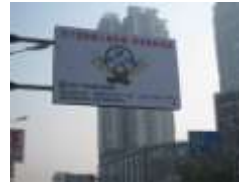
Road signs in Liuzhou