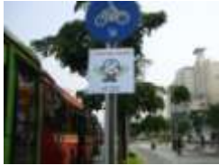
Road signs in Nanning